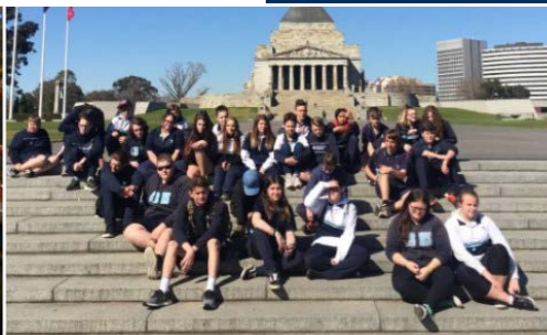
On the steps of the Shrine of Remembrance, Day 3