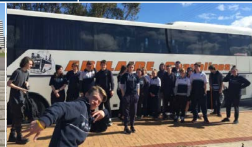
Our coach en route back to CBHS, Day 5.