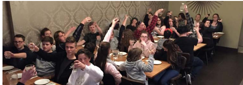
Cheers! Dinner at Universal Italian restaurant, Night 2