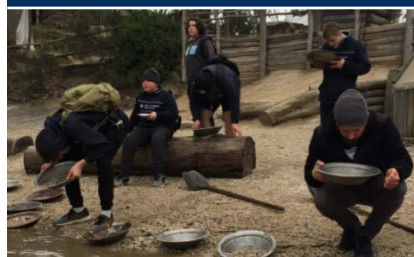
Eureka! We found gold! Sovereign Hill, Day 4.