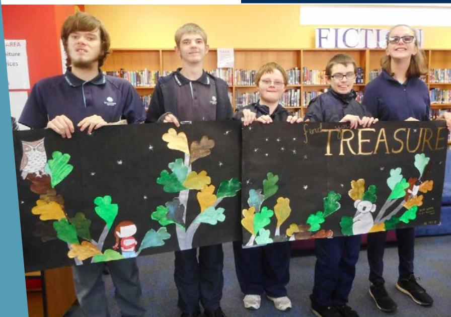
Inclusive Education Centre Students