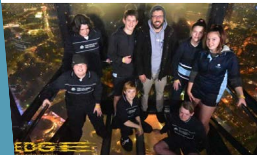
On 'The Edge', 297m above Melbourne. Eureka Skydeck, Night 1