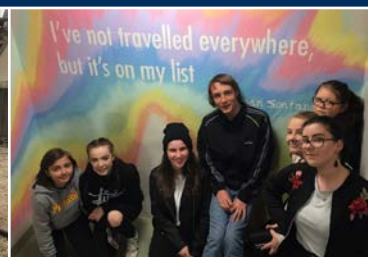
At our accommodation, the Melbourne Metro YHA